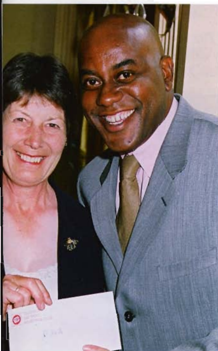
Erness-Roddam of Riding for the TRIC's other regularly supported